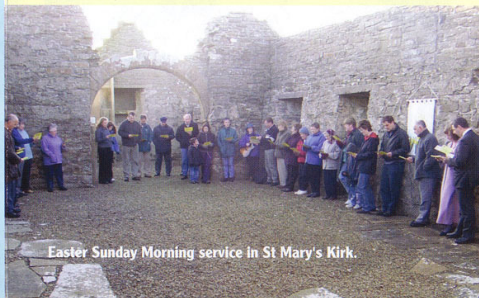
Easter Sunday Morning service in St Mary's Kirk.

You will find a warm welcome at any of these events or services